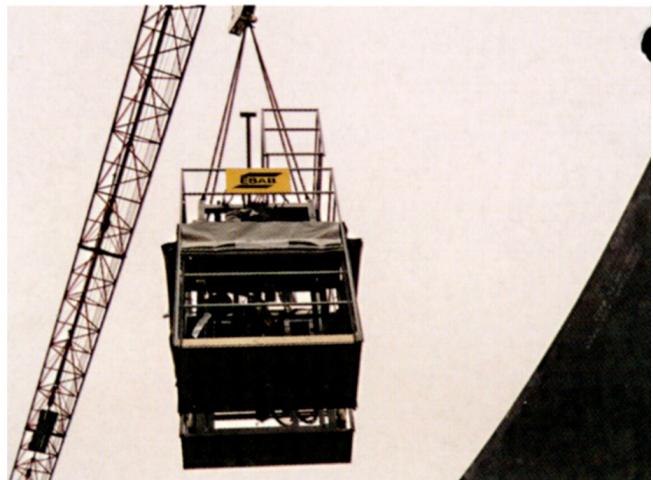
Double-side Circotech being lifted onto the job

The investment in a Circotech installation contributes to a consistent weld quality, which means low defect rate. The consumption of welding consumables is low because of efficient joint preparation. All in all this means good return on investment.